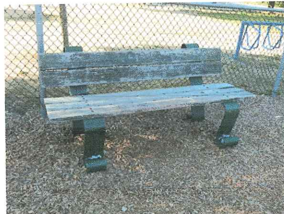
Park benches aging with wood prone to splintering.