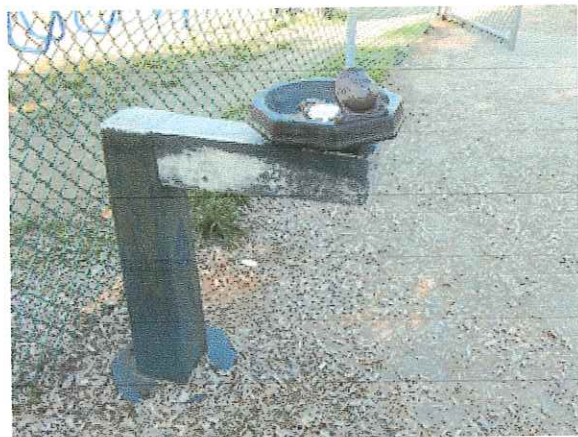
Water fountain rusted and not working. Should be removed.

The images in Figure 4 were taken at the playground, and visually highlight the need to rehabilitate the Town Field Playground.