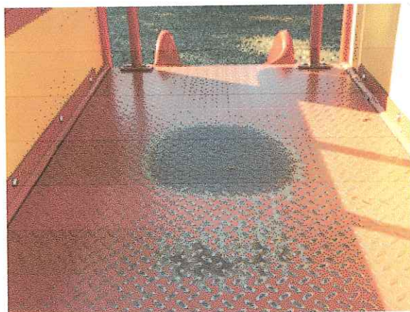
Aging and rusted equipment.