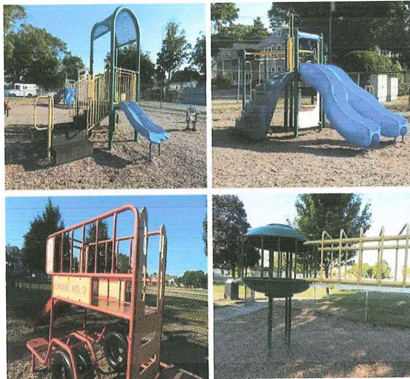
Figure 2: Existing playground equipment at the Town Field Playground.

The focus of this application is to request the final sum of money required to demo the existing playground and courts and construct the new playground and courts per the architectural drawings. Note, the adjacent soccer and baseball fields are outside the scope of work, and all plans are expected to be executed without affecting these fields.