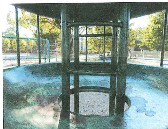
Aging and rusted equipment.