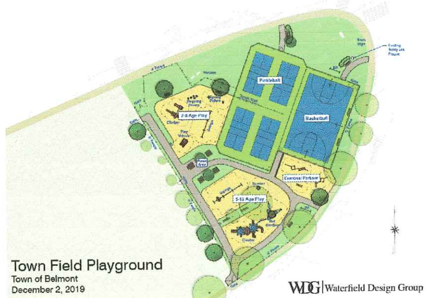
Figure 5: WDG rendering of proposed Town Field Playground and Courts.

Figure 5 shows the final site plan, which was used to determine current cost estimates. These estimates were updated in September 2021 and will be reviewed prior to going out to bid if the project receives a favorable vote during the spring 2022 Town Meeting.