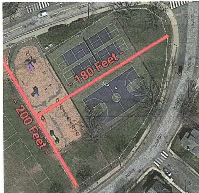
Figure 1: Town Field Playground located at the intersection of Beech and Waverly Streets.

The space is roughly 180 feet by 200 feet, and an approximate area of 36,000 ft 2 as shown in the figure below.