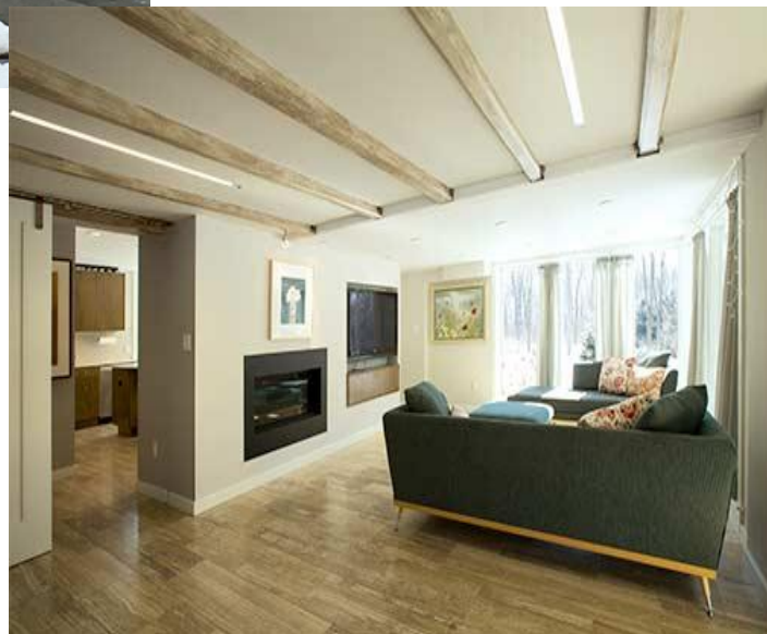
Accessible homes for increased mobility