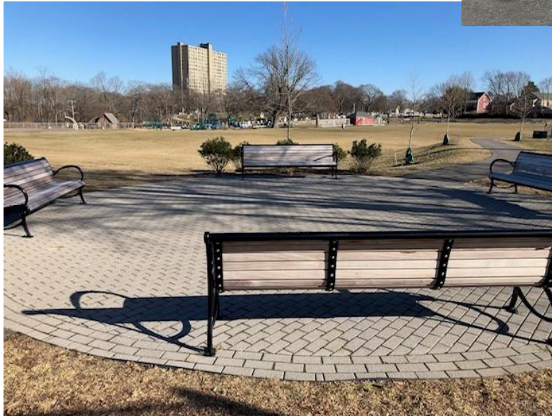
Grove Street Park