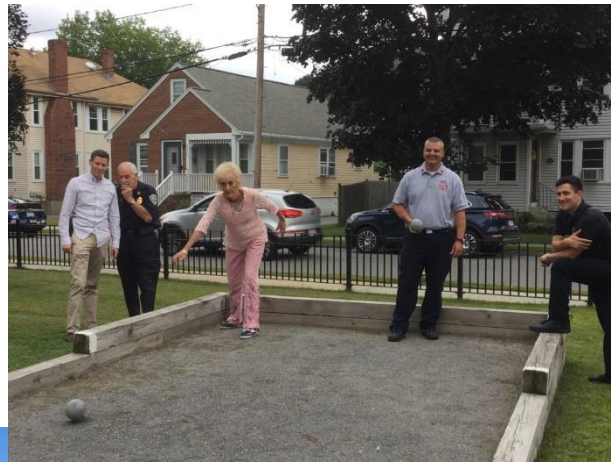
Bocce Court – Senior Center