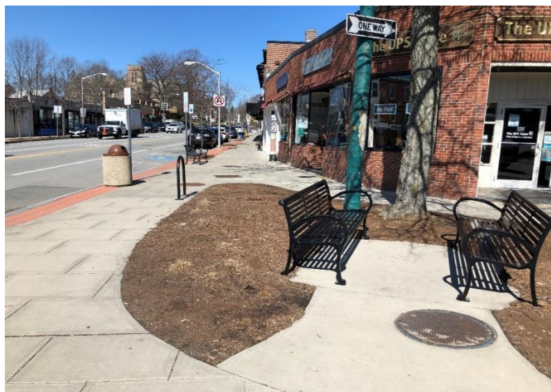
redesigned Cushing Square

transportation within Belmont, however, is quite limited, with the predominant options through the use of COA's vehicles and a recently developed volunteer driver program. Creation of cross-town options for all ages has been suggested multiple times in the past and should be reconsidered, particularly with the development of new housing in the Town. Transportation linking Belmont Center, Cushing Square and Waverley Square should be explored as a starting point. Additionally, existing options should be expanded.